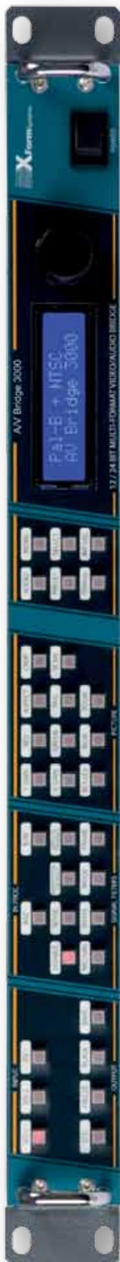
(local control panel not included with the base configuration)